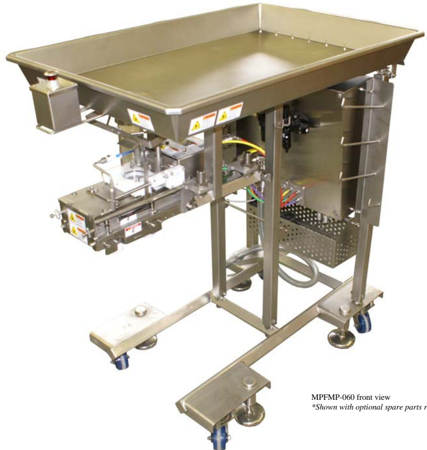
MPFMP-060 front view *Shown with optional spare parts rack

The filling head can be quickly and completely disassembled without tools.