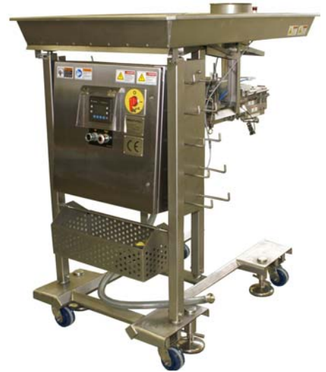
MPFMP-060 rear view *Shown with optional spare parts rack